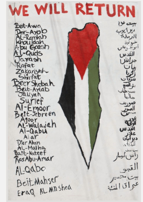
Mural from Aida Refugee Camp