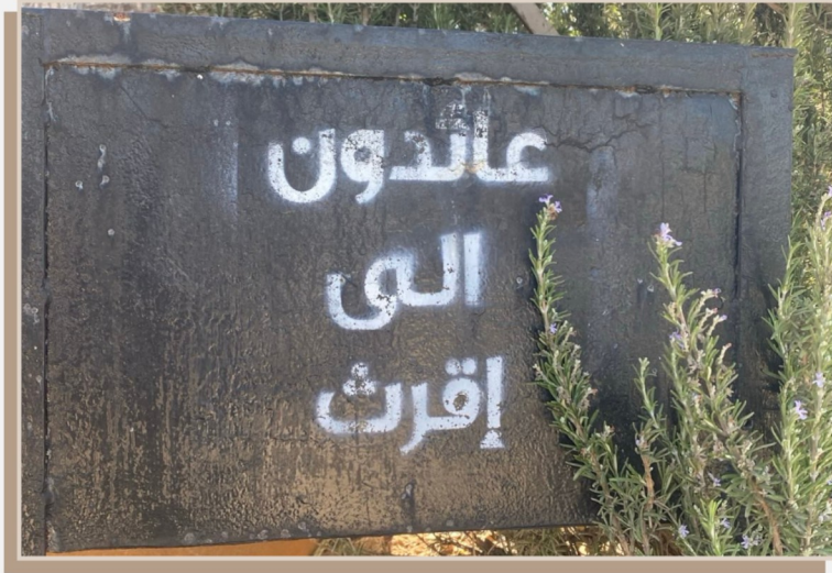
"Returning to Iqrith"

We are committed to the reunion of our people, communities, and homeland.